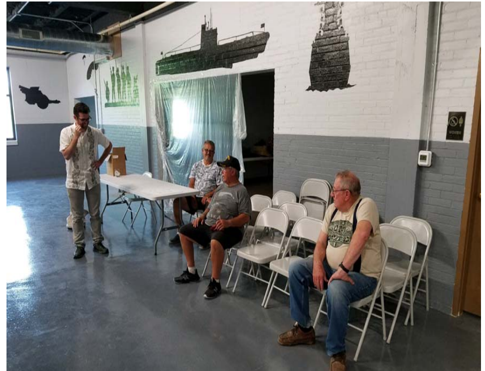
Some Museum Board members and Friends of the Park grab a break after hours of arranging display cases at the Museum.